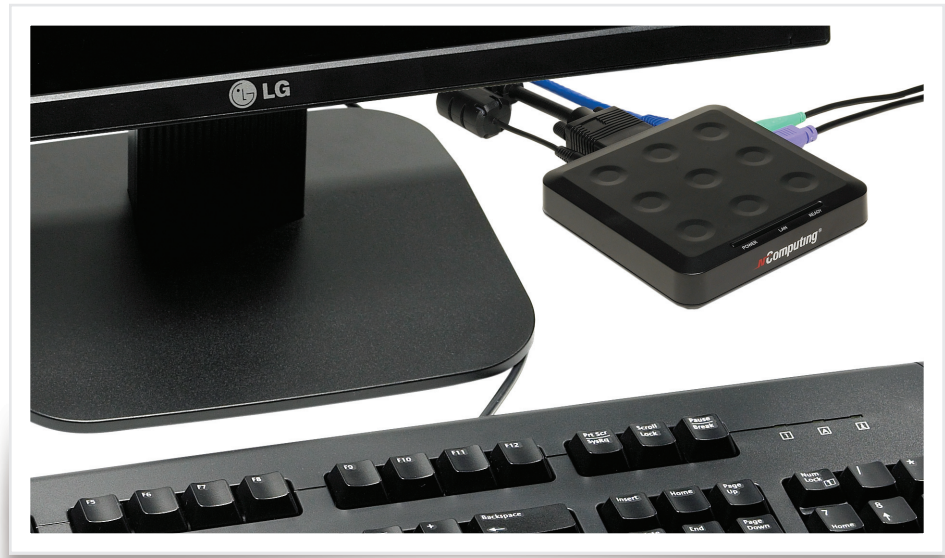
The L-series is ideal for factories, offices, task workers, schools, call centers, and branch offices.

Today's PCs are like supercomputers. And most PC users only use a small fraction—as low as 5%—of the power of their machines. NComputing takes the excess capacity and allows up to 30 users to each enjoy their own rich PC experience. They feel like they have their own PC, but at a fraction of the cost and without all of the maintenance headaches.